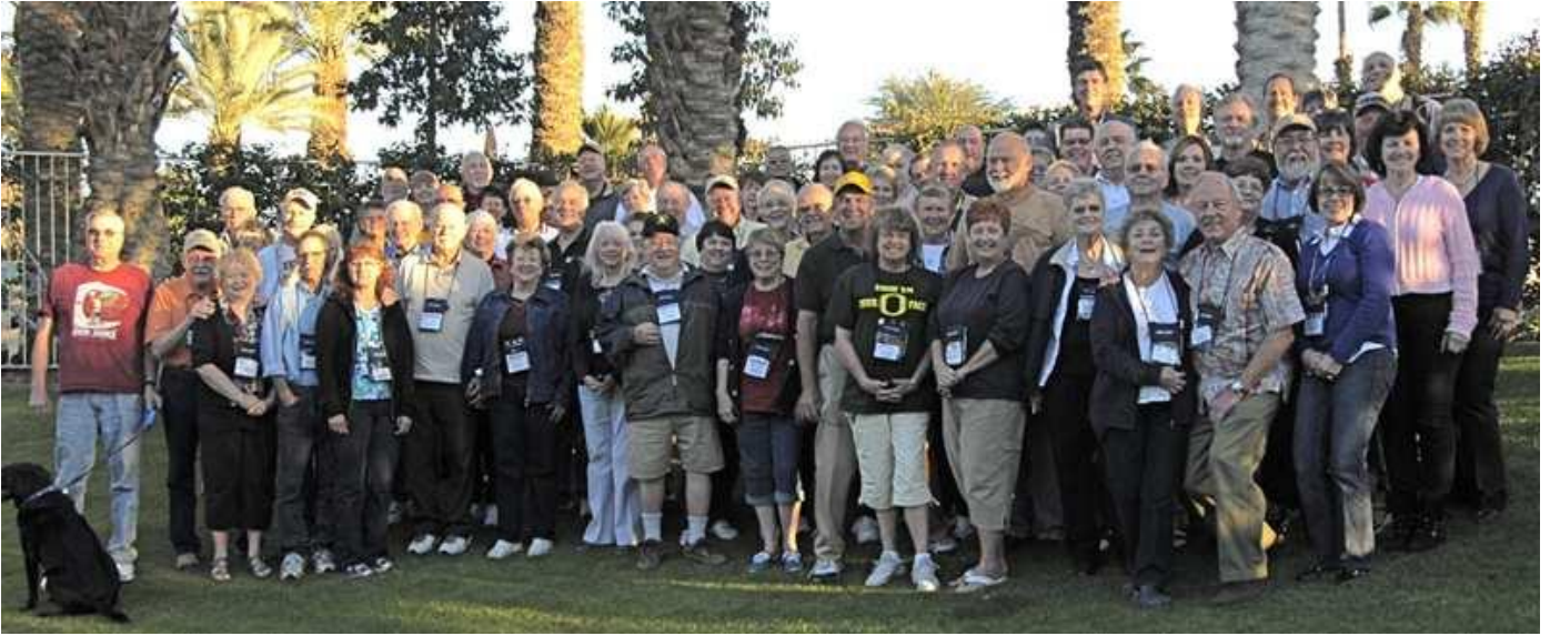
Alfa SeeYas Chapter members attending the Indio Pre-Rally at Emerald Desert Resort CA