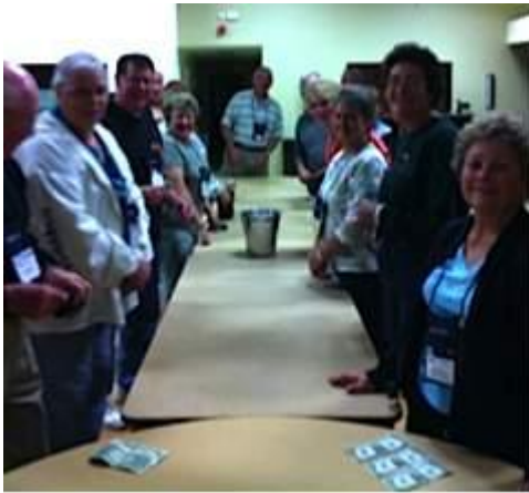
Left Right Center, ready to play!