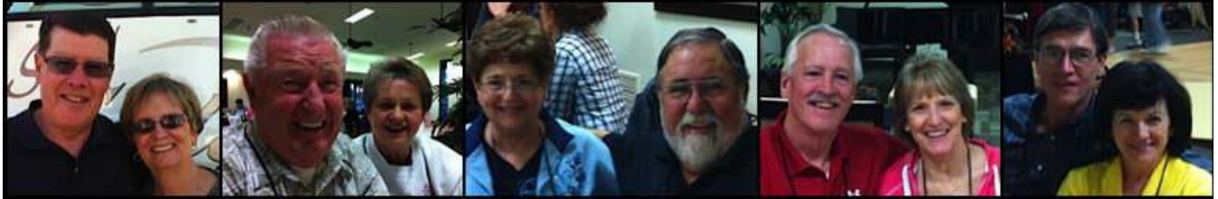
Smiling faces at the AlfaSeeYas Indio Pre-Rally in January 2011