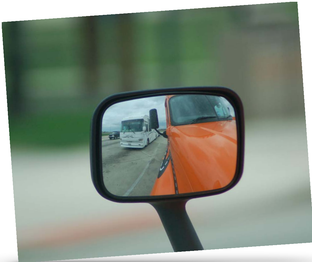
(I have been wanting to use this photo for quite some time!! jmh)