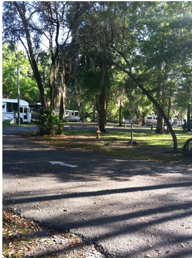
I don't remember where I took this photo....